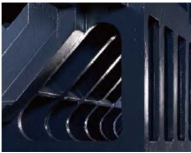
Thick Ribs Imparting High Rigidity