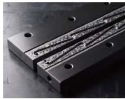
Hand Scraped Box Slideways